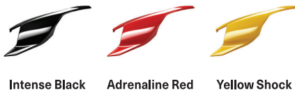
Intense Black Adrenaline Red Yellow Shock