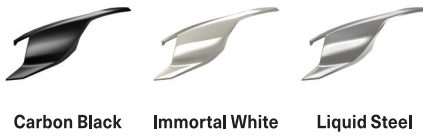
Carbon Black Immortal White Liquid Steel