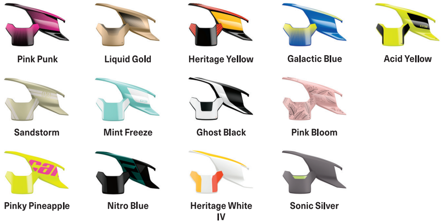
Pink Punk Liquid Gold Heritage Yellow Galactic Blue Acid Yellow Sandstorm Mint Freeze Ghost Black Pink Bloom Pinky Pineapple Nitro Blue Heritage White IV Sonic Silver