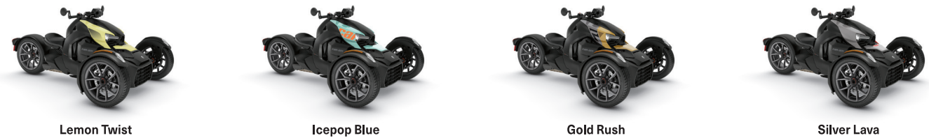
Lemon Twist Icepop Blue Gold Rush Silver Lava